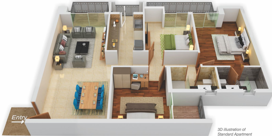
3D illustration of Standard Apartment