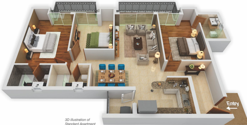
3D illustration of Standard Apartment