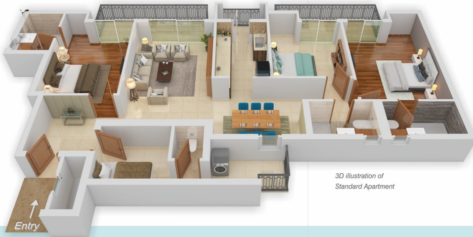
3D illustration of Standard Apartment